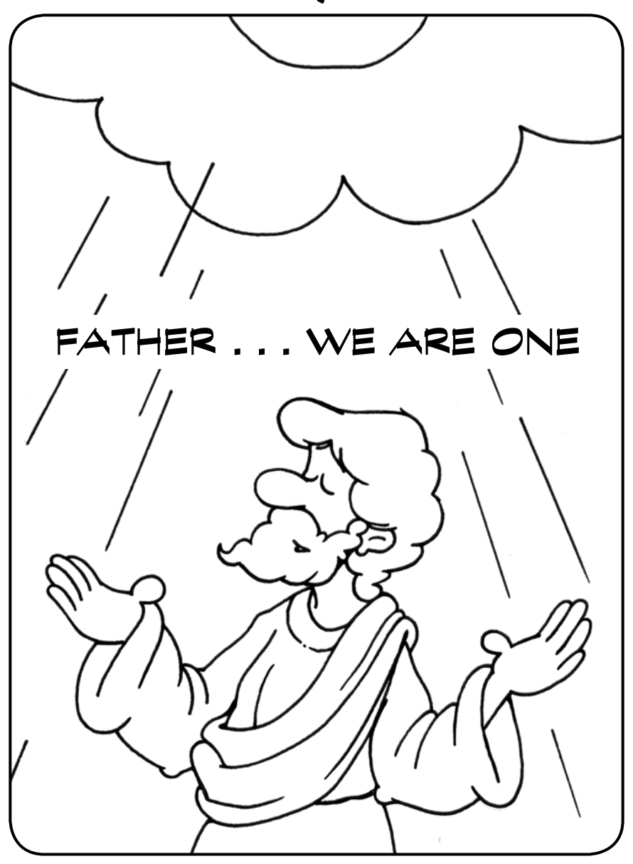
Father, the hour has come; glorify Your Son that the Son may glorify You. John 17:1