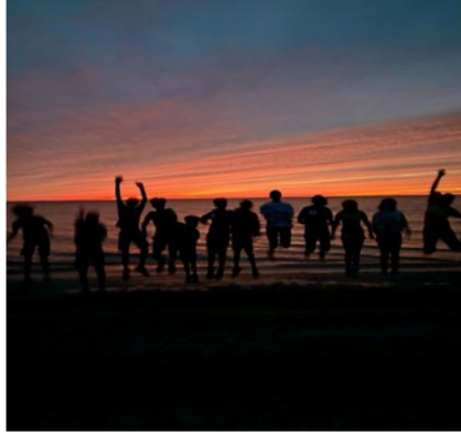
Youth Group in front of Lake Erie